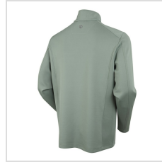
Sea Spray (S72025-75)