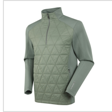
Sea Spray (S72025-75)