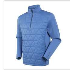
Twilight Blue (S72025-79)