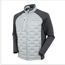
Charcoal/ Pure White (S72005-8504)