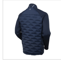
Midnight/ Midnight (S72005-3131)