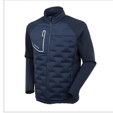
Midnight/ Midnight (S72005-3131)