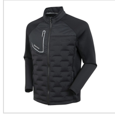
Black/ Magnesium (S72005-0286)