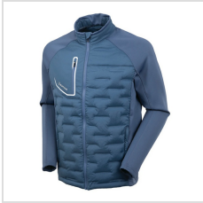
Vintage Indigo/ Pure White (S72005-4004)