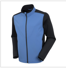
Twilight blue/Black (S52006-7902)