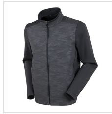
Charcoal Camo/Charcoal (S52006-8585C)