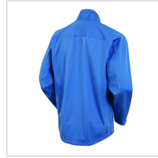
Twilight Blue (S42016-79)