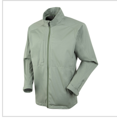
Sea Spray (S42016-75)