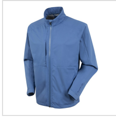
Twilight Blue (S42016-79)