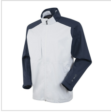
Midnight/Pure White (S42016-3104)