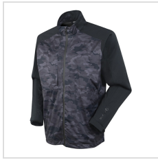
Black/Charcoal Camo (S42016-0285C)