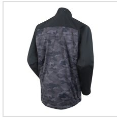
Black/Charcoal Camo (S42016-0285C)