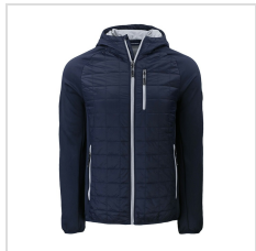
Dark Navy (MCO00092-DN)