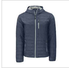
Anthracite Melange (MCO00091-ANM)