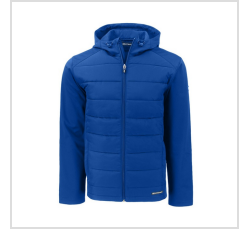
Tour Blue (MCO00077-TBL)