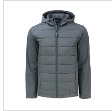
Elemental Grey (MCO00077-EG)