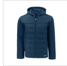
Navy Blue (MCO00077-NVBU)