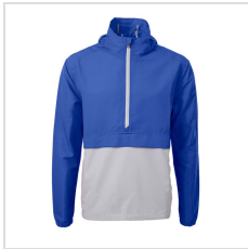
Tour Blue/Polished (MCO00074-TBPOL)