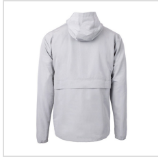
Cutter and Buck Charter Eco Recycled Anorak Jacket-