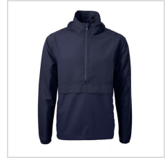
Navy Blue (MCO00074-NVBU)