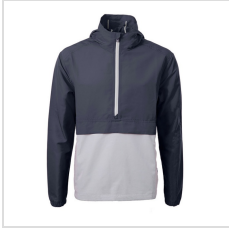
Navy Blue/Polished (MCO00074-NVPOL)