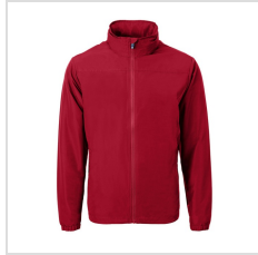
Cardinal Red (MCO00073-CDR)