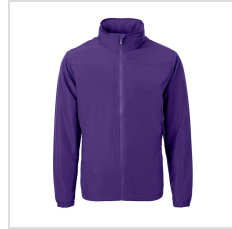
College Purple (MCO00073-CLP)