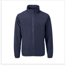
Navy Blue (MCO00073-NVBU)