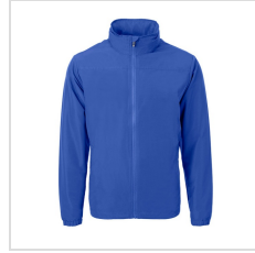
Tour Blue (MCO00073-TBL)