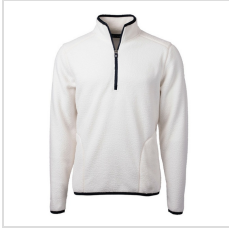
Shell/Navy Blue (MCO00071-SHNV)