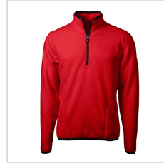
Red/Navy Blue (MCO00071-RDNV)