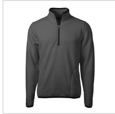
Elemental Grey/Black (MCO00071-EGBL)