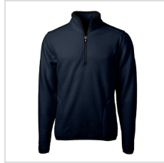
Navy Blue (MCO00071-NVBU)