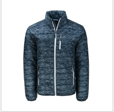
Dark Navy (MCO00068-DN)