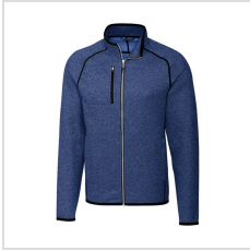
Tour Blue Heather (MCO00050-TBH)