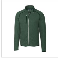
Hunter Heather (MCO00050-HH)