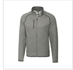
Polished Heather (MCO00050-POH)