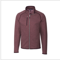
Bordeaux Heather (MCO00050-BRH)