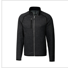
Charcoal Heather (MCO00050-CCH)