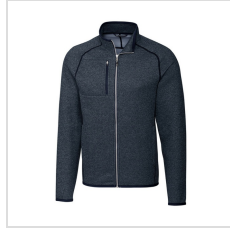
Liberty Navy Heather (MCO00050-LNH)