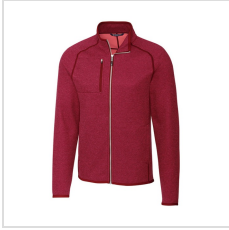
Cardinal Red Heather (MCO00050-CRH)