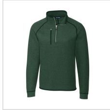
Hunter Heather (MCO00049-HH)