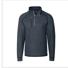
Liberty Navy Heather (MCO00049-LNH)