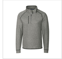
Polished Heather (MCO00049-POH)