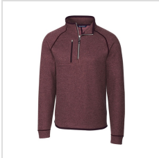
Bordeaux Heather (MCO00049-BRH)