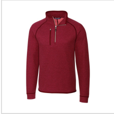
Cardinal Red Heather (MCO00049-CRH)