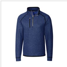
Tour Blue Heather (MCO00049-TBH)