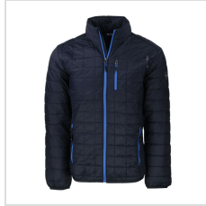
Dark Navy (MCO00018-DN)