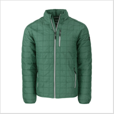
Hunter Melange (MCO00018-HNM)