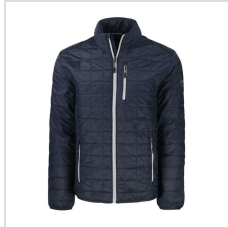
Dark Navy/Silver (MCO00018-DNSV)