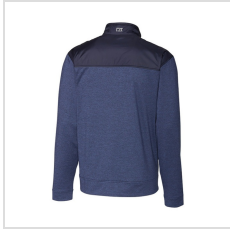
Cutter and Buck Stealth Hybrid Quilted Full Zip Windbreaker Jacket