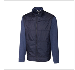
Liberty Navy (MCK09406-LYN)