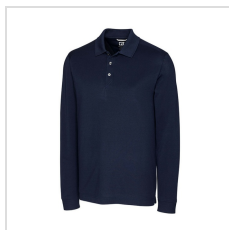
Liberty Navy (MCK09322-LYN)