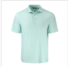
Fresh Mint (MCK01391-FRM)