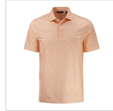
College Orange (MCK01391-CLO)