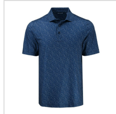
Navy Blue (MCK01391-NVBU)