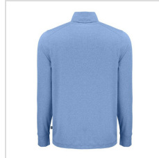
dark atlas heather (MCK01373-DALH)