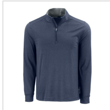
dark navy blue heather (MCK01373-DNVH)