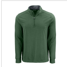
Dark Hunter Heather (MCK01373-DHH)