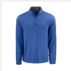
Tour Blue Heather (MCK01373-TBH)