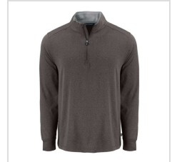
dark black heather (MCK01373-DBLH)