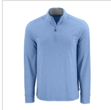
dark atlas heather (MCK01373-DALH)