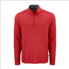
cardinal red heather (MCK01373-CRH)