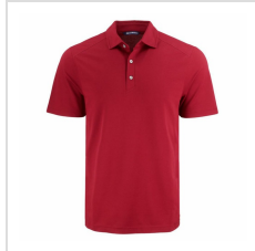
Cardinal Red (MCK01358-CDR)