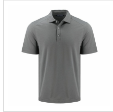
Elemental Grey (MCK01358-EG)