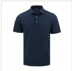
Liberty Navy (MCK01358-LYN)