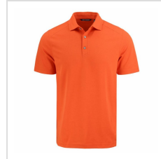
College Orange (MCK01358-CLO)