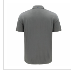
Elemental Grey (MCK01358-EG)