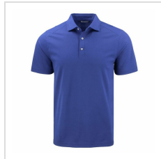
Tour Blue (MCK01358-TBL)