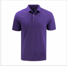
College Purple (MCK01358-CLP)