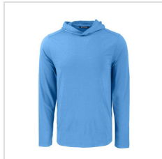
Digital Blue (MCK01330-DG)