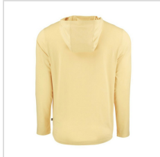
Desert Yellow (MCK01330-DES)