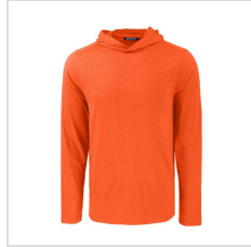
College Orange (MCK01330-CLO)