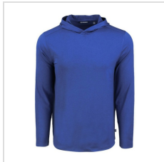
Tour Blue (MCK01330-TBL)