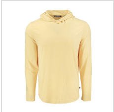
Desert Yellow (MCK01330-DES)