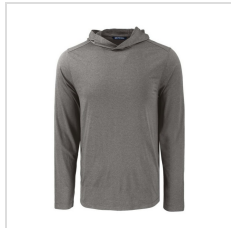
Elemental Grey (MCK01330-EG)