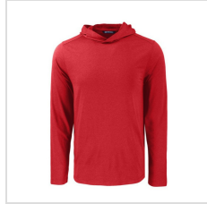
Cardinal Red (MCK01330-CDR)