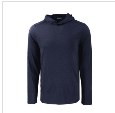
Navy Blue (MCK01330-NVBU)