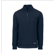
Navy Blue (MCK01308-NVBU)