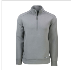
Elemental Grey (MCK01308-EG)