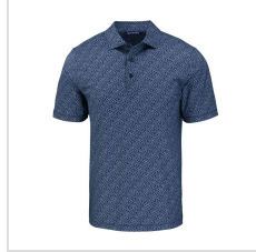
Navy Blue/White (MCK01304-NVBW)