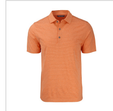
College Orange Heather (MCK01303-CGH)