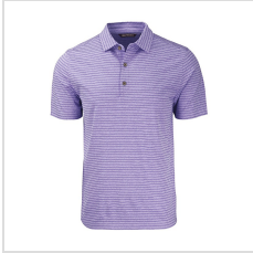
College Purple Heather (MCK01303-CPH)