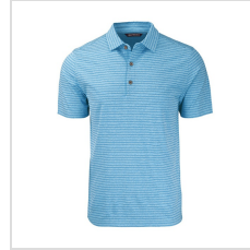
Digital Heather (MCK01303-DGH)