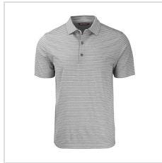
Elemental Grey Heather (MCK01303-EGH)