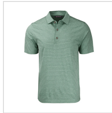
Hunter Heather (MCK01303-HH)