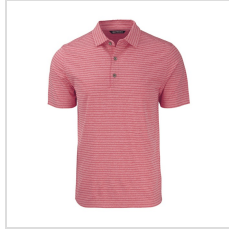
Cardinal Red Heather (MCK01303-CRH)