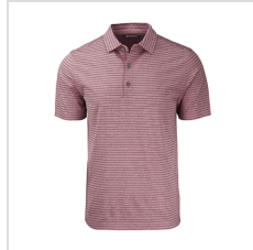
Bordeaux Heather (MCK01303-BRH)