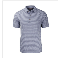
Navy Blue Heather (MCK01303-NVH)