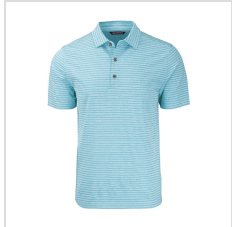
Atlas Heather (MCK01303-ALH)