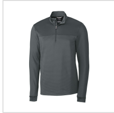
Elemental Grey (MCK00088-EG)