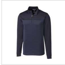
Liberty Navy (MCK00088-LYN)