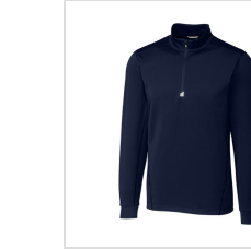
Liberty Navy (MCK00067-LYN)