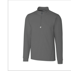
Elemental Grey (MCK00067-EG)