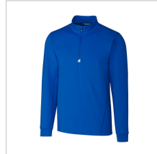
Tour Blue (MCK00067-TBL)