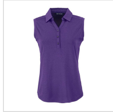
Dark College Purple Heather (LCK00197-DCPH)