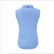
Dark Atlas Heather (LCK00197-DALH)