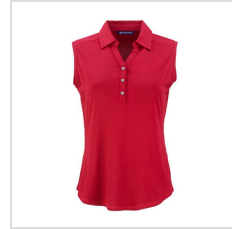
Cardinal Red (LCK00197-CDR)