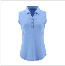
Dark Atlas Heather (LCK00197-DALH)