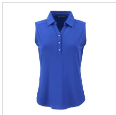
Tour Blue (LCK00197-TBL)