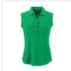
Kelly Green (LCK00197-KG)