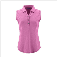
Gelato Heather (LCK00197-GEH)