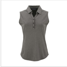
Dark Heather Black (LCK00197-DBLH)