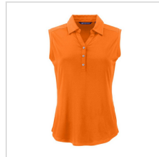
Orange Burst (LCK00197-ORB)