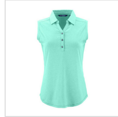
Fresh Mint Heather (LCK00197-FMH)