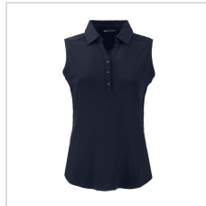
Navy Blue (LCK00197-NVBU)