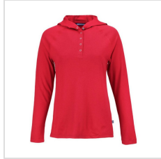
Cardinal Red (LCK00184-CDR)