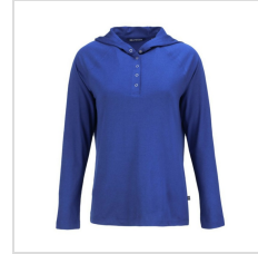
Tour Blue (LCK00184-TBL)