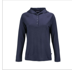
Navy Blue (LCK00184-NVBU)