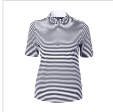
Navy Blue (LCK00157-NVBU)