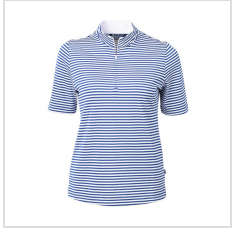
Tour Blue (LCK00157-TBL)