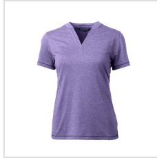
College Purple Heather (LCK00153-CPH)