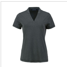
Dark Black Heather (LCK00153-DBLH)