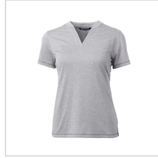
Polished Heather (LCK00153-POH)