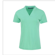
Fresh Mint Heather (LCK00153-FMH)