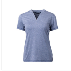
Indigo Heather (LCK00153-IDH)