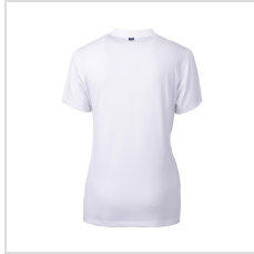
Cutter and Buck Ladies Forge Heathered Stretch Blade Top-