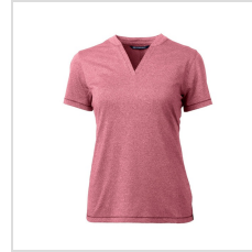
Cardinal Red Heather (LCK00153-CRH)