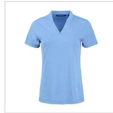
Dark Atlas Heather (LCK00153-DALH)