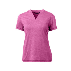
Gelato Heather (LCK00153-GEH)