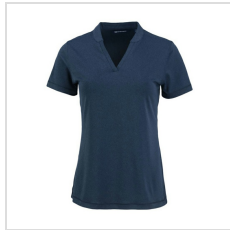
Dark Navy Blue Heather (LCK00153-DNVH)