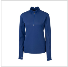
Tour Blue (LCK00033-TBL)