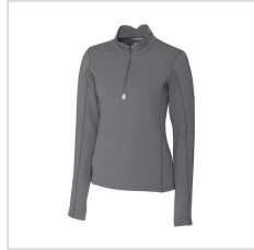
Elemental Grey (LCK00033-EG)