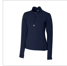
Liberty Navy (LCK00033-LYN)