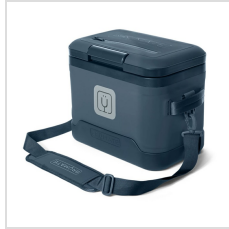
Nightfall Blue (COMP12NFB)