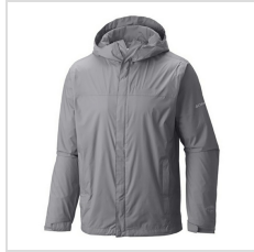
Columbia Grey (C2602MO-039)