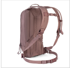
Rose Taupe (BKHP57RTP)