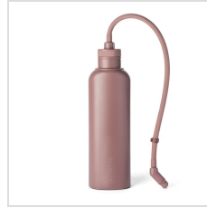
Rose Taupe (BKHP57RTP)