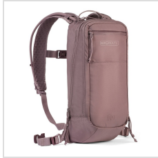
Rose Taupe (BKHP57RTP)