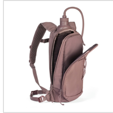
Rose Taupe (BKHP57RTP)