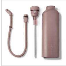
Rose Taupe (BKHP57RTP)