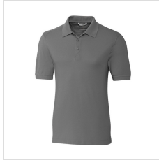
Elemental Grey (BCK09321- EG)