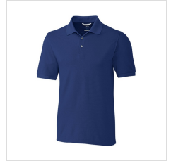
Tour Blue (BCK09321-TBL)