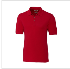
Cardinal Red (BCK09321- CDR)