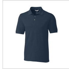
Liberty Navy (BCK09321- LYN)