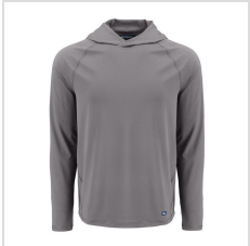
Elemental Grey (BCK01363-EG)