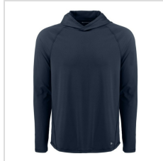
Navy Blue (BCK01363-NVBU)