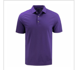
Liberty Navy (BCK01358- YN)