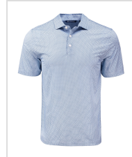
Navy Blue (BCK01343-NVBU)