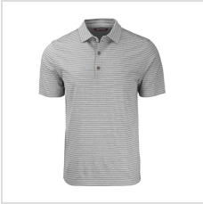
Elemental Grey Heather (BCK01303-EGH)