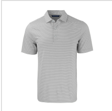
Polished/White (BCK01302- POLWH)