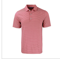
Cardinal Red/White (BCK01302- CDRW)