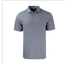
Navy Blue/White (BCK01302- NVBW)