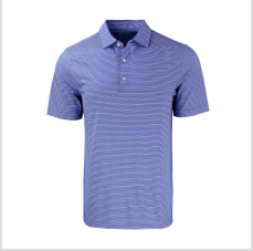
Tour Blue/White (BCK01302- TBWH)