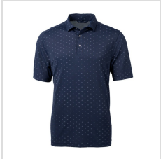
Navy Blue (BCK01170- NVBU)