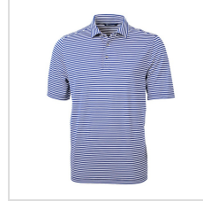
Tour Blue (BCK01168-TBL)