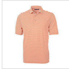
College Orange (BCK01168-CLO)