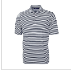
Navy Blue (BCK01168-NVBU)