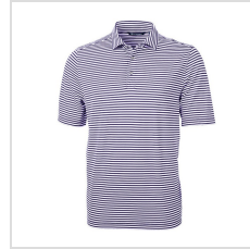
College Purple (BCK01168-CLP)