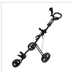
Full View (A99933)