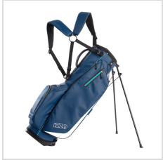
Light Blue (A81104)