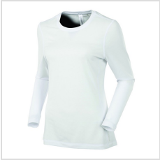
Pure White Melange (885525-04M)