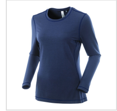
Midnight Melange (885525-31M)