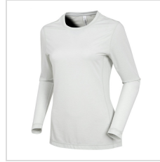
Down Grey Melange (885525-08M)