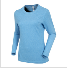
Sapphire Blue Melange (885525-32M)