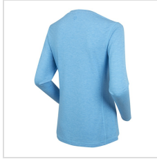
Sapphire Blue Melange (885525-32M)