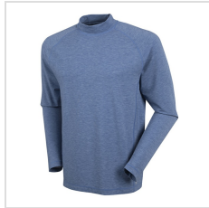
Dusk Blue Melange (885027-44M)