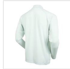
Down Grey Melange (885027-08M)