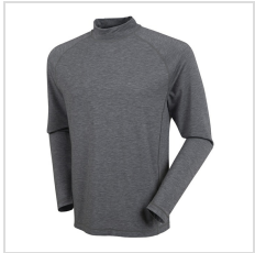
Charcoal Melange (885027-85M)