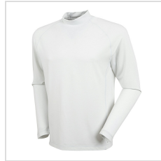
Down Grey Melange (885027-08M)