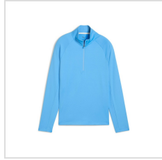
Team Light Blue (629449-06)