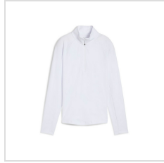
White Glow (629449-08)