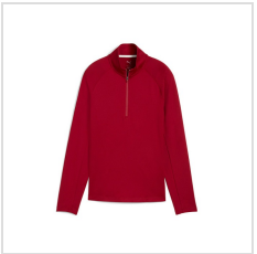
Dark Crimson (629449-10)