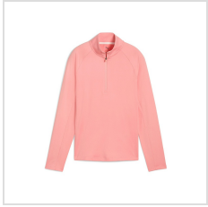
Pink Fruit (629449-05)