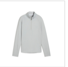
Ash Grey (629449-11)