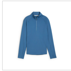
Blue Horizon (629449-03)