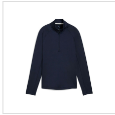
Deep Navy (629449-02)