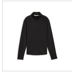
Puma Black (629449-01)