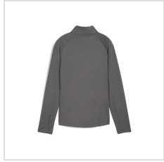
Slate Sky (629449-07)