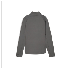
Puma Ladies Pure 2.0 1/4 Zip