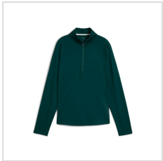
Dark Myrtle (629449-09)