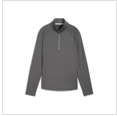
Slate Sky (629449-07)