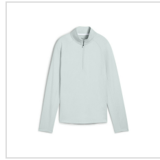
Peaceful Blue (629449-04)