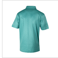
Glaze Green (25S23MP-307)