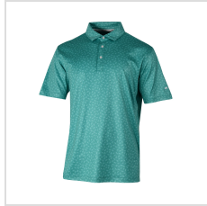
Glaze Green (25S23MP-307)