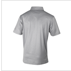
Cool Grey (25S23MP-019)