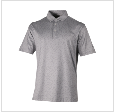
Cool Grey (25S23MP-019)