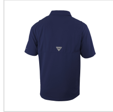
Collegiate Navy (23S41MP-464)