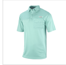
Gulf Stream (23S41MP-499)