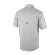
Cool Grey (23S41MP-019)