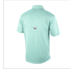
Gulf Stream (23S41MP-499)