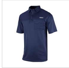
Collegiate Navy (23S41MP-464)