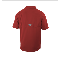
Intense Red (23S41MP-610)