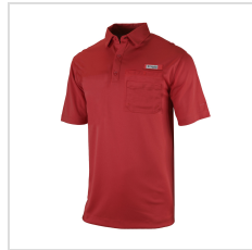
Intense Red (23S41MP-610)