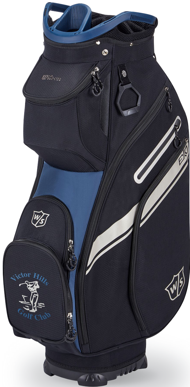
*Logo size varies depending on bag style

Maximum logo size: 5"w × 3"h Personalization: 3 lines, up to 12 characters per line.