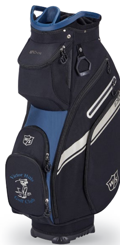
Black | Blue