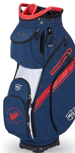
Navy | Red