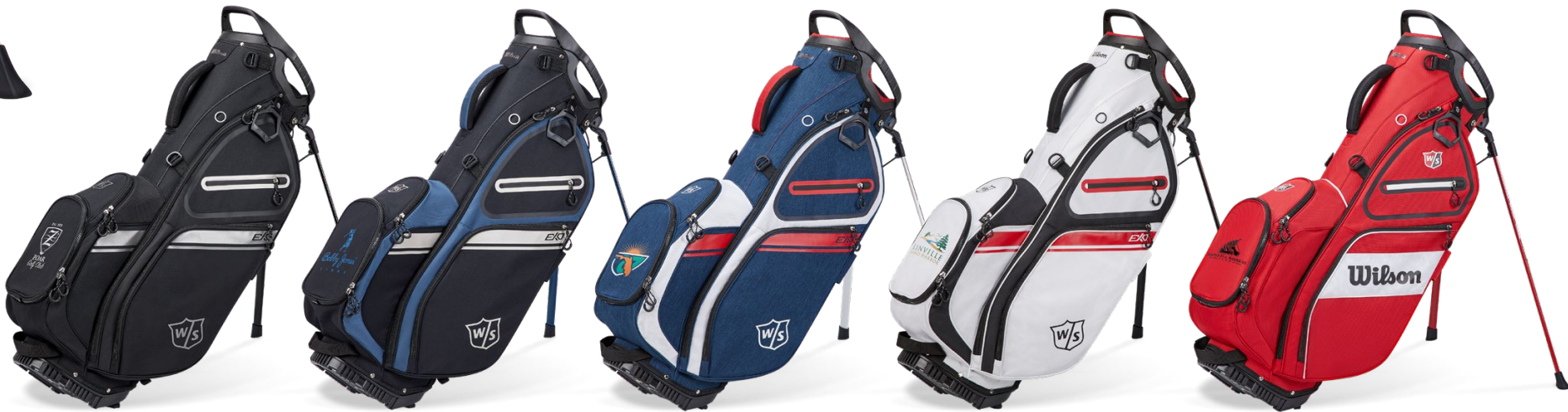
Black | Silver