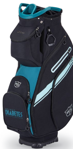
Black | Teal