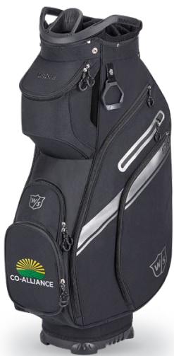
Black | Silver